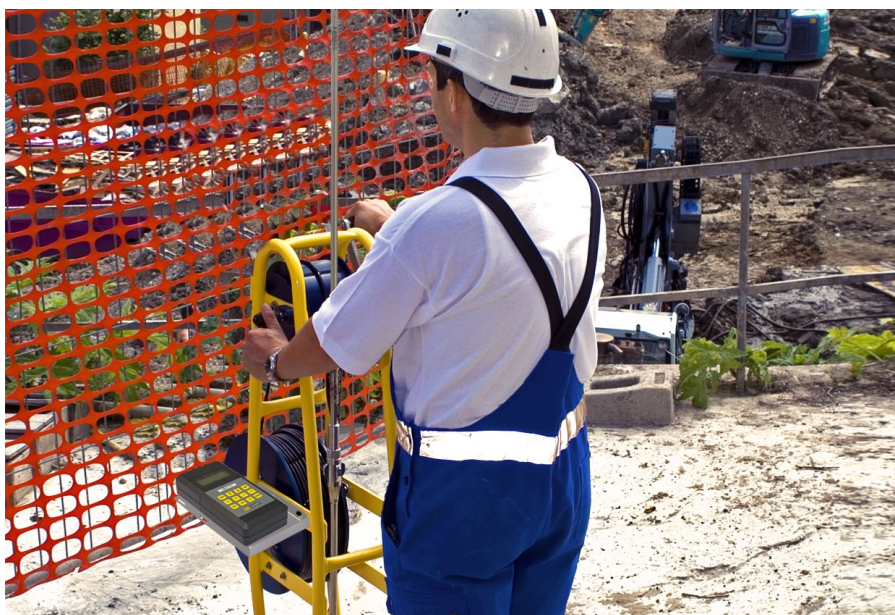
Sliding Deformer and Sliding Micrometer measurement with the MRD