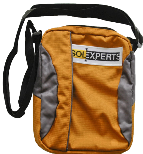
MRD carrying bag