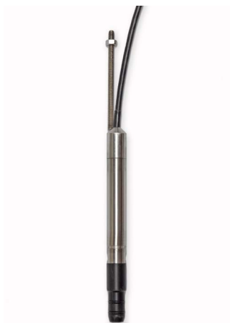
Pressure sensor with connection for installation rods