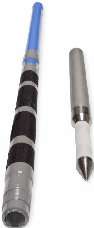
HPVC (left) and press-in filter tip (right)