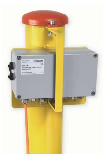
Piezopress protective tube with SDL data logger