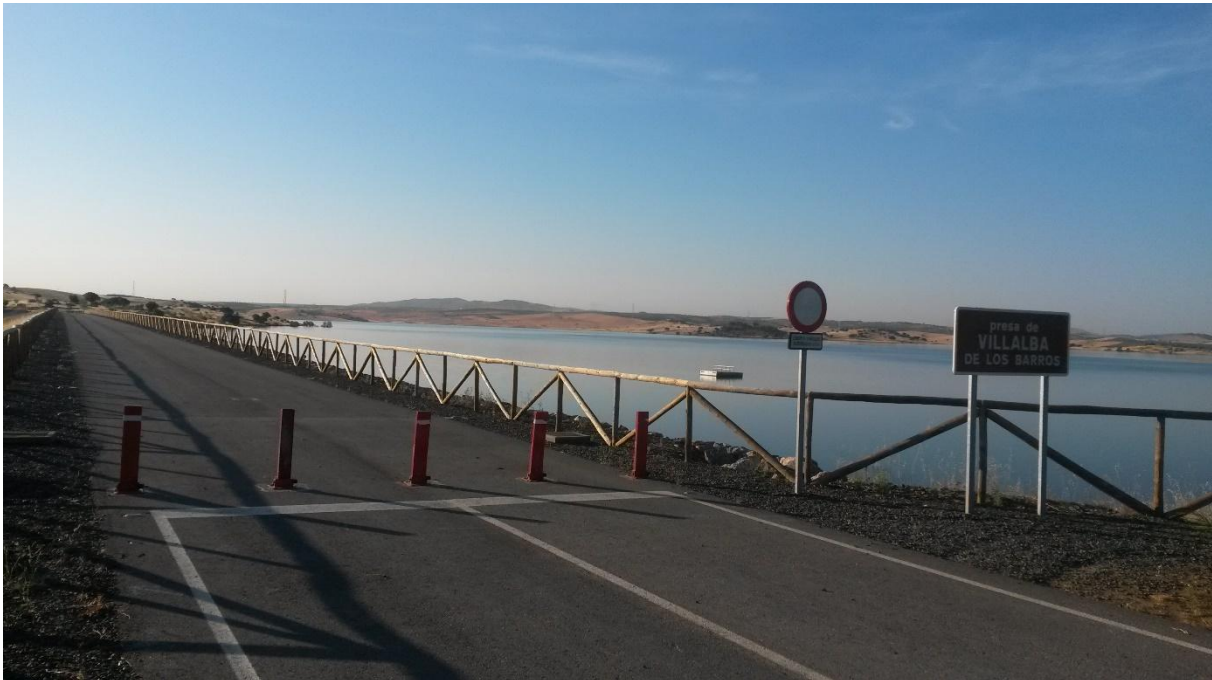
Villalba de los Barros Dam, Spain

The monitoring of dams and embankments is essential for the detection and the localisation of leakage in the sealing at an early stage. Temperature measurements using fibre optic cables are used in order to detect leakage at an early stage and thus prevent expensive consequential damage. In case of a new construction of a dam the direct integration of a fibre optic cable is advisable. Then, temperatures can be measured within the structure.