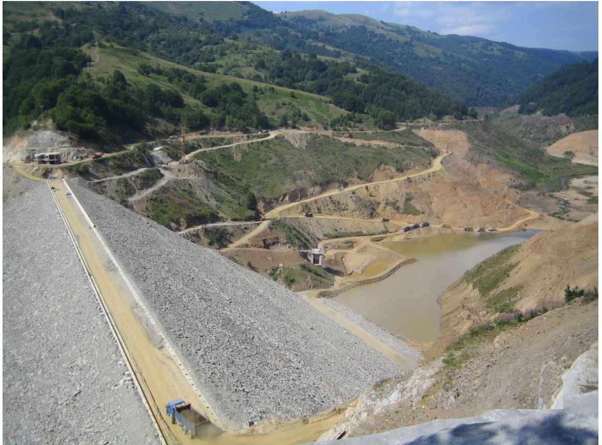
Knezovo Dam: late construction phase

A rockfill dam with an asphalt core required leakage detection and seepage monitoring using GTC Kappelmeyer's Fiber Optic Leakage Detection method with an AP Sensing DTS (Distributed Temperature Sensing) device.