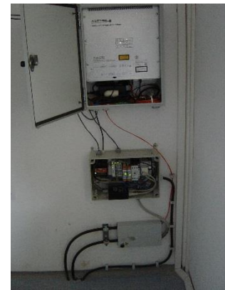
Interior DTS installation

Both the DTS device and the Heat-Pulse control unit make use of the ModBus protocol and are connected to the local network via TCP/IP. The AP Sensing DTS Configurator and the customer-specific evaluation software are installed on a local PC.