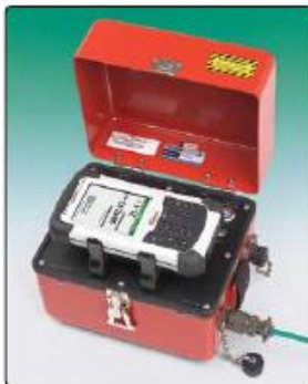
● Model GK-405 Vibrating Wire Readout for manual data acquisition.