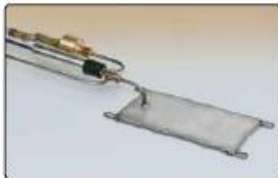
● Model 4850 NATM Shotcrete Stress Cell with electro-hydraulic pressure switch (for confirmation of measured pressure).