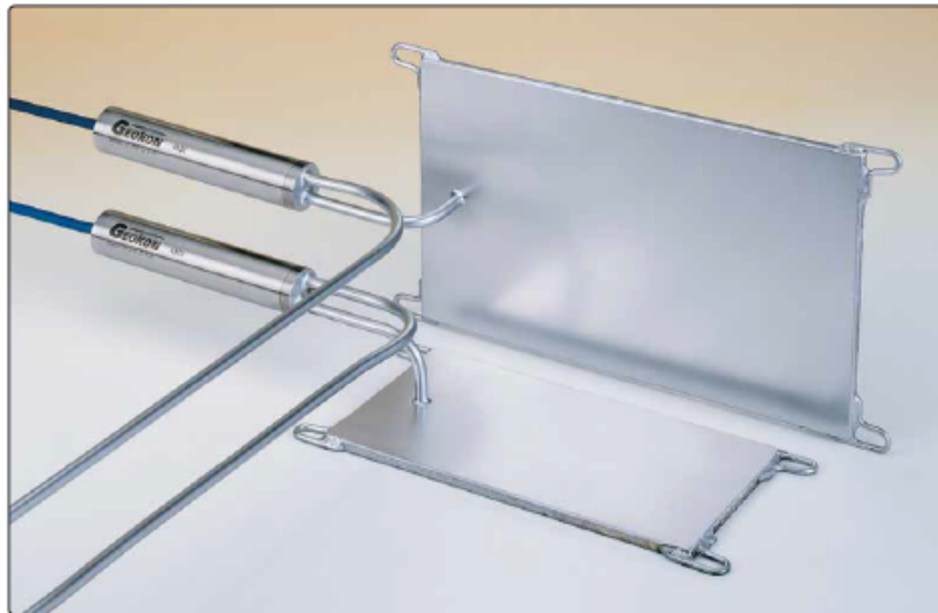
• Model 4850-1 (bottom) and 4850-2 (top) NATM Style Shotcrete Stress Cells