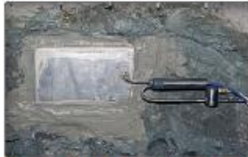
● Model 4850 NATM Shotcrete Stress Cell with remote re-pressurization option.