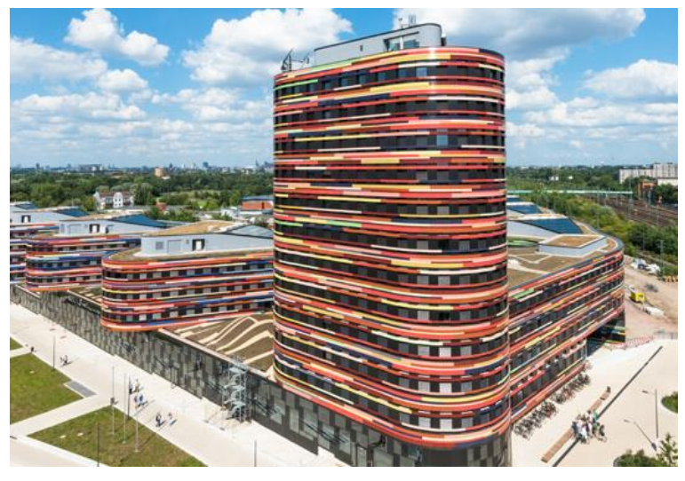
Hamburg Ministry of Urban Development and Environment

When the Hamburg Ministry of Urban Development and Environment moved into their new buildings they decided to make use of geothermal heat exchange pipes to heat the buildings in Winter and keep them cool in Summer. Over 1600 boreholes and borepiles were drilled and heat exchangers were installed in over 800 borepiles. In 27 boreholes fiber optic sensor cable was also installed to enable temperature monitoring with AP Sensing's DTS (Distributed Temperature Sensing) solution.