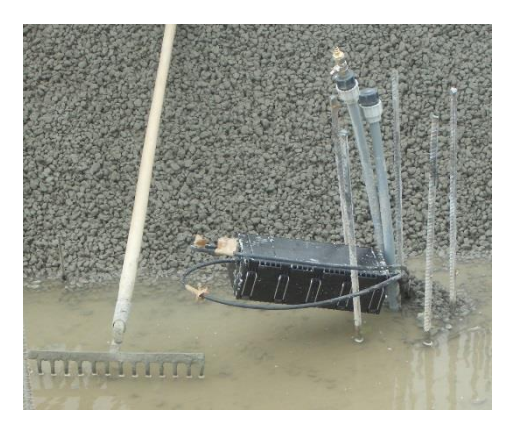
Joint box used to connect cables during installation

The well-insulated buildings are among the most energy-efficient offices in Germany, requiring only 70 kWh per square meter per year.