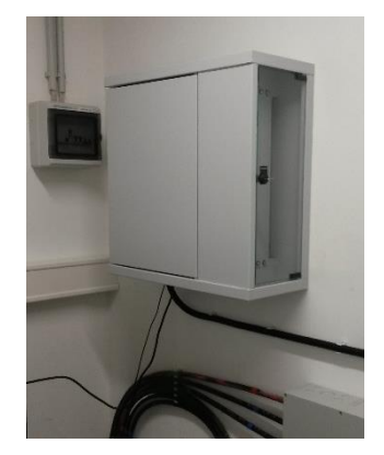
19" AP Sensing DTS device mounted in a flat wall cabinet